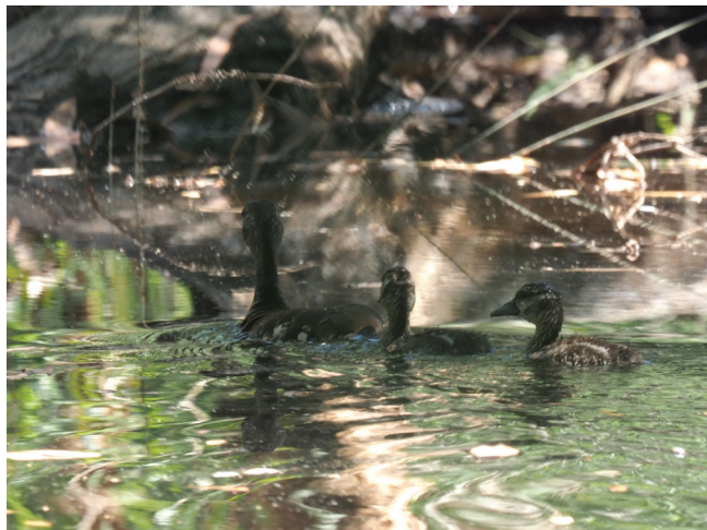
Figure 2. Spotted Whistling-Duck adult swimming with two juvenile ducklings in an inundated Melaleuca forest habitat in Milikapiti on Melville Island, NT on 12/05/2023.