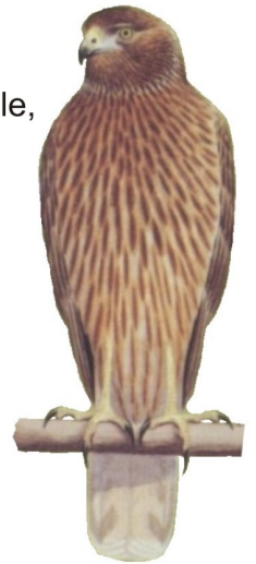
Adult Male, dark