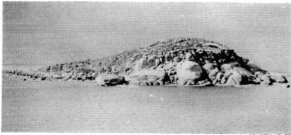
● Wright Island (looking north-east).