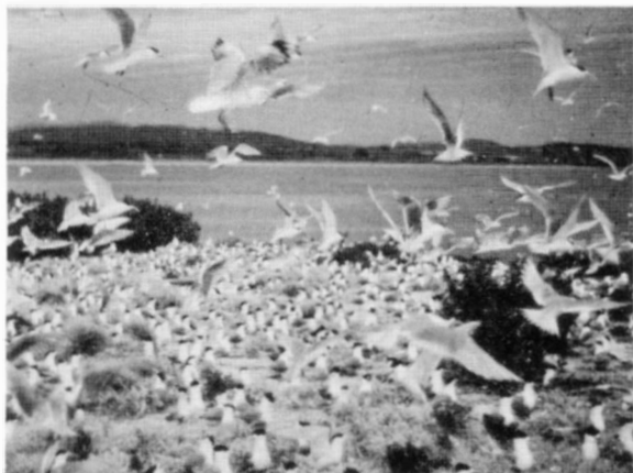
● Crested Terns nesting on the north-west end of Egg Island.