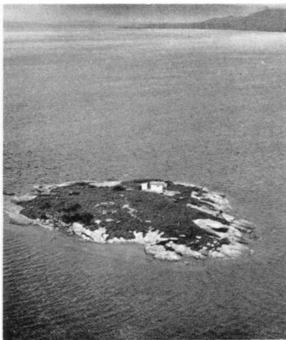
● Fisher Island.