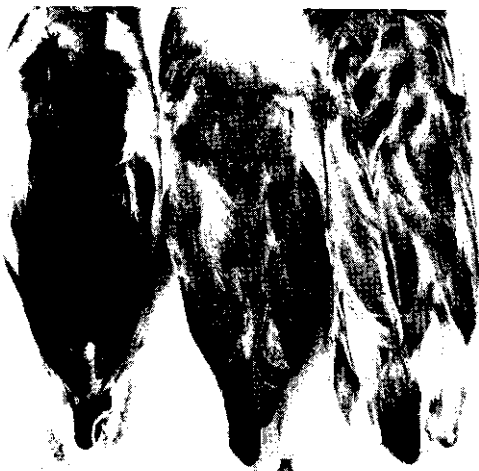
● Figure 1. Back colouration of dorsal surfaces of small bitterns (left to right) Little Bittern (male, female); Yellow Bittern.

The sexes of the Little Bittern are incorrectly listed as similar in Slater (1970) and Reader's Digest (1976), as this widespread Old World species is one of the few herons to demonstrate sexual dichromatism. The adult male, with its diagnostic black back, cannot be confused with any of the plumages of the Yellow Bittern. This plumage is illustrated in Slater (plate 15, figure 6) and MacDonald (1973, plate 2). It is with the female that difficulties may arise. This plumage is not illustrated in any readily available reference book and bears a close similarity in colouration of the back to that of the adult Yellow Bittern (Fig. 1). Female Little Bitterns bear less resemblance to Slater's illustrated male than they do to the pictured Yellow Bittern (plate 15, figure 8) and consequently, on the basis of these illustrations, yellowish-brown backed individuals may be incorrectly identified.