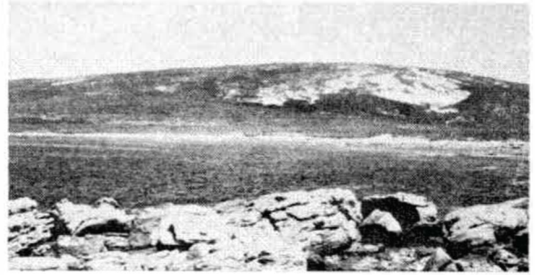
● Figure of Eight Island, south end (looking south-west).

Cereopsis novaehollandiae Cape Barren Goose — Two non-flying young and three "adults" were seen in 1981.