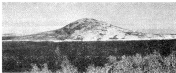
● Remark Island (looking south).