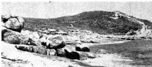
● Part of the north side. Note the tent in the centre of the picture.