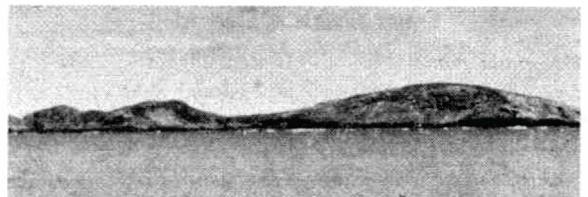
● Hood Island (looking north-west).