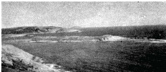
● Lorraine Island from the nearby mainland (looking south-south-east). Hammer Head is the large feature in the centre background at left.

Pelagodroma marina — 1 adult (2 Nov. 81).