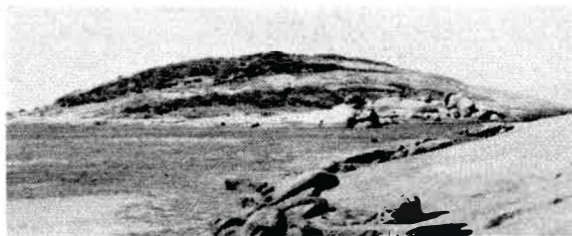
● Nares Island (looking north-east).

Pelagodroma marina White-faced Storm-Petrel — Serventy recorded four burrows of these birds, one empty, on 29 November 1950 2 . On 2 November 1981, four "fresh" burrows were checked but the birds were absent; there were a number of disused, collapsed and broken burrows in a few places. The cause appeared to be the very shallow soil in which the burrows had been dug. The remains of one bird was seen. Possibly three or four pairs nest regularly on the island.