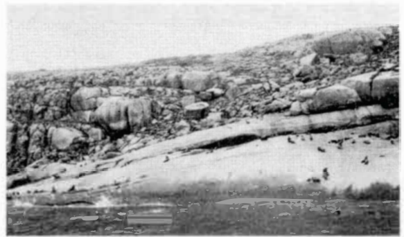
• Part of the seal colony, north-eastern side.

25 November 1978; they found Little Penguins, Short-tailed Shearwaters and Pacific Gulls nesting. Our visit, also of an hour, on 13 December 1978, was made in torrential rain.