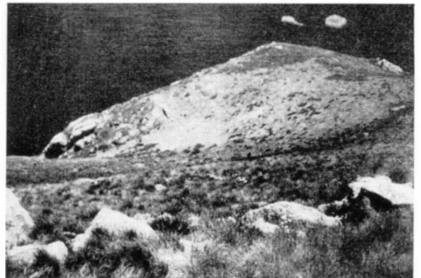
• Part of the western end, from the summit.