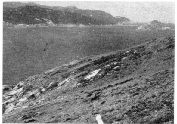
• Part of the north-eastern corner (looking east), with Wattle Island and Wilsons Promontory in the background.