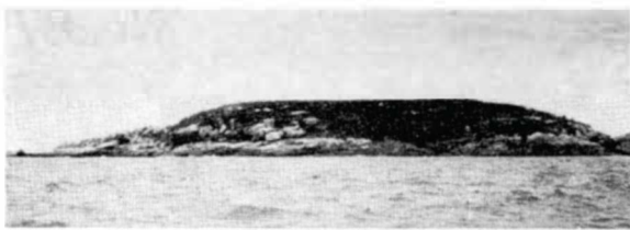
• Rabbit Rock (looking south)