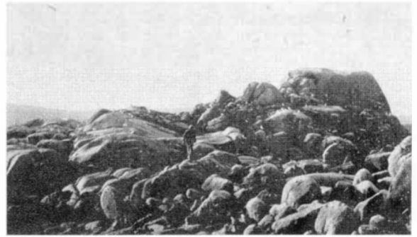
• Part of the centre islet (looking north).