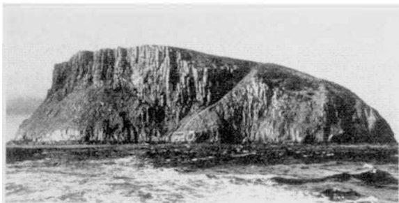
• Tasman Island (looking southward); the east landing stage is in the centre of the picture.

anywhere around the shore. However, some difficulty may be encountered climbing up the steep slopes to reach the plateau if a landing is made elsewhere but the two sites mentioned.