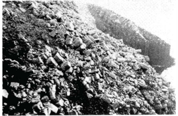
• The East Boulder Slope (looking north-east).