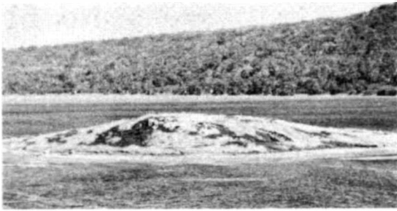
● Green Island (looking south-east).

and young; on 28 November 1975 there were only a few nests and one chick; on 19 August 1976 there were 300 pairs; but on 16 September 1977, some 4 000 to 5 000 pairs had eggs and young, the nests being constructed almost to the high tide level.