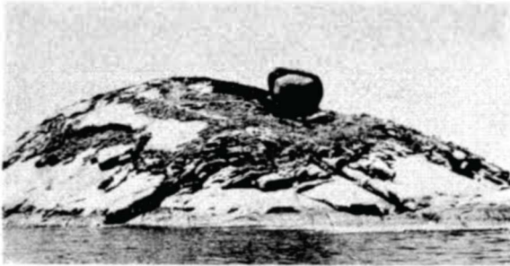
● View of the north-west side.

(pers. comm.) reported about 200 pairs with eggs.