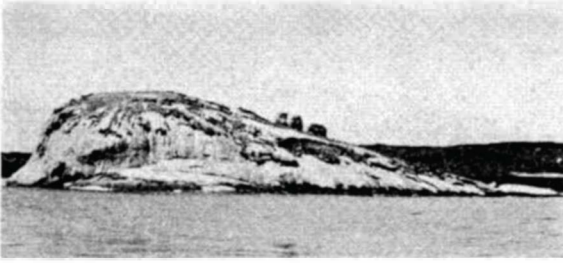
● Seal Island (looking south).