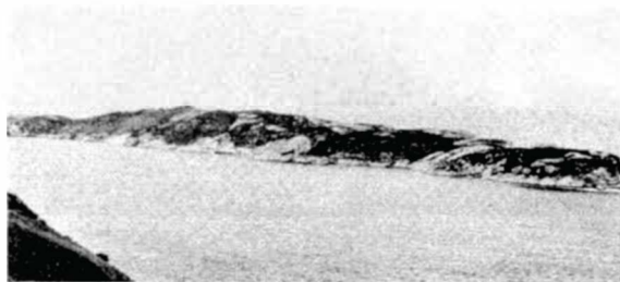
● Breaksea Island, viewed from the summit of Michaelmas Island (looking south-east).

Eudyptula minor Little Penguin—In 1975, hundreds were noted calling along the northern