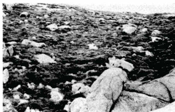
● Part of the northern side near the western end.

side of the island. At night, individuals were met even on the backbone of the island. It took them about 30 minutes to reach the top of the island above the jetty, which is a distance along the ground of nearly 200 m sloping steeply to some 70 m in height. No doubt, they breed regularly on the island, although an accurate estimate of the numbers has not been made. The figure could be from 100 to 1 000 breeding pairs.