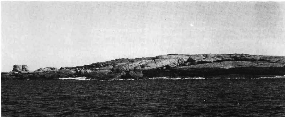
● Harlequin Island (looking south-west).