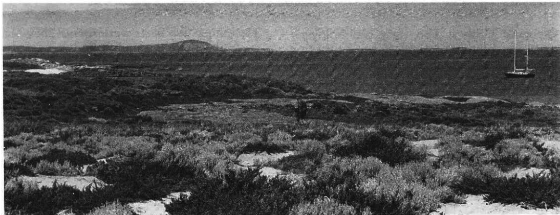
• View over part of Wickham Island (looking south).