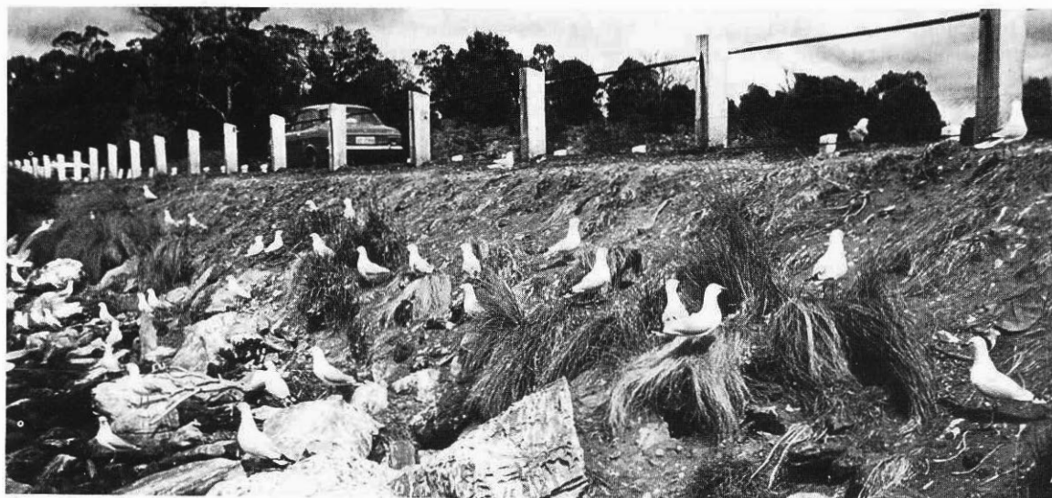
Figure 2. Nesting site of Silver Gull on embankment of causeway.

Prior to 1980 about ten pairs of Silver Gulls bred on Fisher Island each season, but since 1980 between 200 and 300 pairs have nested annually. The sudden increase in numbers was probably due to a fish processing factory commencing operations only 400 m away in the latter part of the 1970's and thus providing a source of food. The gulls bred in an area approximately 50 × 50 m which included part of the main colony of 40 pairs of shearwaters, and shearwaters abandoned burrows where seagulls were present. In most years the gulls were already breeding when Short-tailed Shearwaters returned from their trans-equatorial migration in the third week of September.