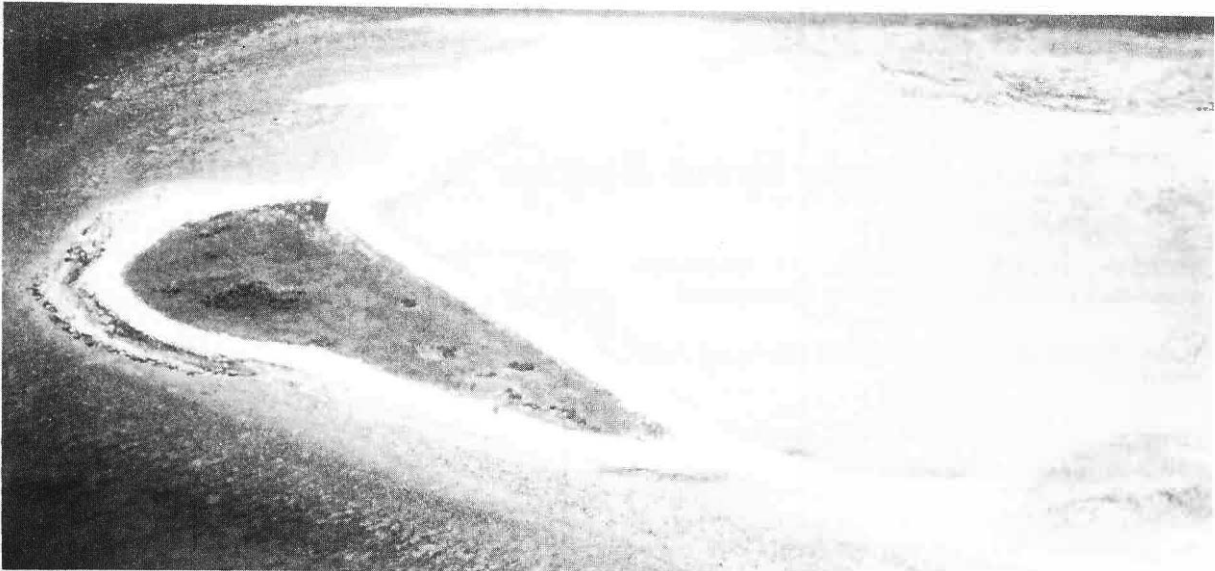
• Magra Island from the air (looking east).

Sterna dougallii Roseate Tern — In June 1981 there were over 400 adults present, with at least 100 juveniles. In addition there were over 200 recently-dead chicks and juveniles on the strand and in open areas of the grassflat. Nests are simple scrapes in the sand, and one or two eggs are laid.