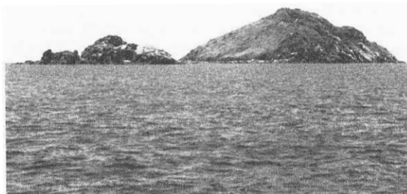
● Holbourne Island (looking west) with south-eastern rocks at left.

Part of the south-western lowland was mined for phosphate rock early this century 4,5 . It is not known what species were responsible for the guano deposits but seabird colonies may have deserted the island as a result of mining operations. The great numbers of birds noted in 1879 4 are now gone. A cover of white excrement is present on the south-eastern rocks and on the eastern cliff face of the main island where at least 2 000 Brown Boobies roost at night (winter observations). These boobies may be descendants of a large guano-producing colony.