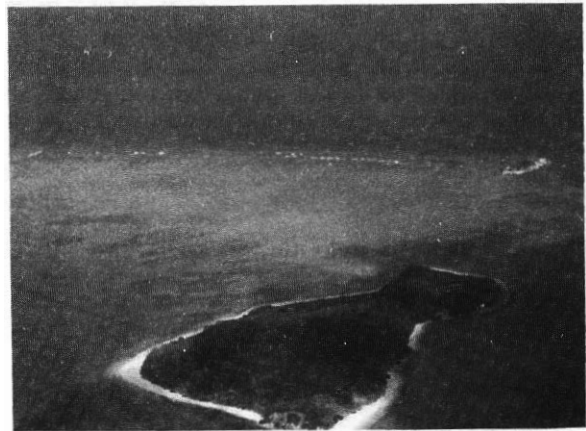
● Oblique view of Rocky Islet (looking north-east) with East Islet in the background at right.

Sterna bergii Crested Tern — Two eggs were found on South-west Islet in February 1982. Twenty adults were counted on this islet prior to landing. Four were later noted at the East Islet. During a stay on Rocky Islet, Crested Terns were frequently observed feeding in the shallows close to the beach on the northern side.