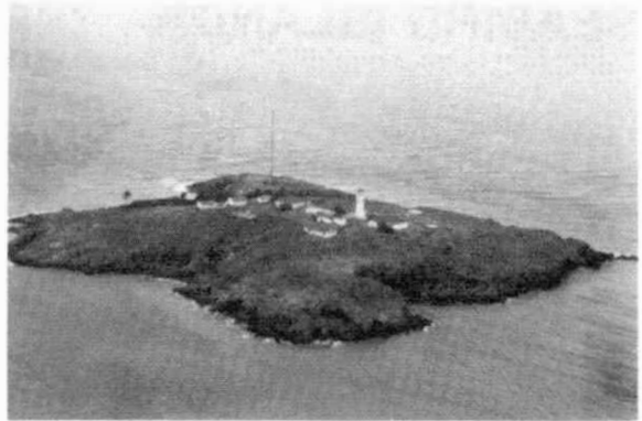
• Booby Island from the air (looking north-east)

Sterna anaethetus Bridled Tern — At least 50 breeding pairs nest on rock ledges or in rock clefts up to 1.5 m deep around the edges of the island. Egg size (mm; n=6) 45.7 \pm 2.1 \times 33.2 \pm 1.1 Clutch size: six nests had one egg; all 22 chicks were alone. These terns return to the island in August. An adult caught on 2 September 1984 had an egg in the abdomen. The same adult was caught on 27 November 1986 feeding an almost-fledged chick. In December chicks ranged from fully fledged to downy but no eggs were present. The last unfledged chick was caught on 24 January 1988. Presence of Bridled Terns is unusual after January; those banded in February 1987 were sheltering from a storm and were significantly lighter ( 108 \pm 9.7 g; n=27) than breeding birds caught in September 1984 ( 157 \pm 8.3 g; n=4) or