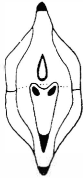
Figure 2. Inside mouth of nestling Rufous Songlark showing distinctive pattern of spots.

tongue tipped black or grey, while the tongues of others were edged all round with black or grey. This variation in tongue colour may provide a useful ageing character for female Rufous Songlarks when more information on its timing is obtained. Data are insufficient at the moment; no birds were retrapped during the study, so individual changes in tongue markings could not be detected. Any females with pink palates should be considered as '2+'.