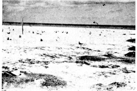
• Masked and Brown Boobies nesting on Bylund Cay.