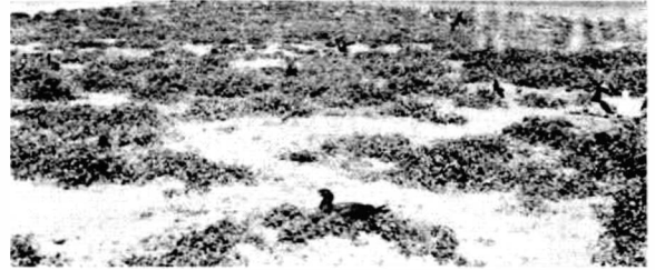
• Vegetation on Frigate Cay with Brown Boobies nesting in foreground.

The surface of the cay is less than 3 m above high water and is therefore susceptible to overwash and erosion by the sea during severe storms. Gulls predate unattended eggs of the other species and this activity increases when people visit the island. Human visitation to the cay is low but is becoming more frequent. Nest-