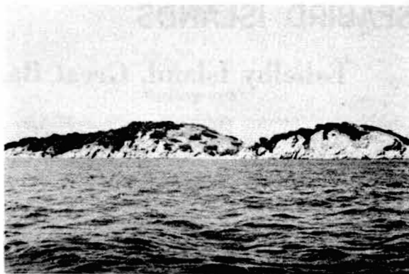
● Eshelby Island (looking east).

Eshelby Island supports the largest Bridled Tern colony in eastern Australia and one of the largest Crested Tern colonies in Australia. It is