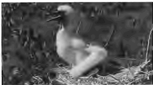
• Red-footed Booby chick on Adele Island (first photos ever taken in Western Australia).

Sula dactylatra Masked Booby — Recorded by Walker 11 on his visit in 1891, these birds are well established and mostly breed close to the shoreline along the western, southern and south-eastern end of the island. Some birds nest around the western and southern end of the lagoon and a few amongst Spinifex between the lagoon and the western side. Smith et al. 9 estimated about 100 pair on 18 June, 1972. Abbott 1 counted 177 nests on 4 June, 1978 and Moore 2 counted 320 nests between 19 July and 2 August, 1982.