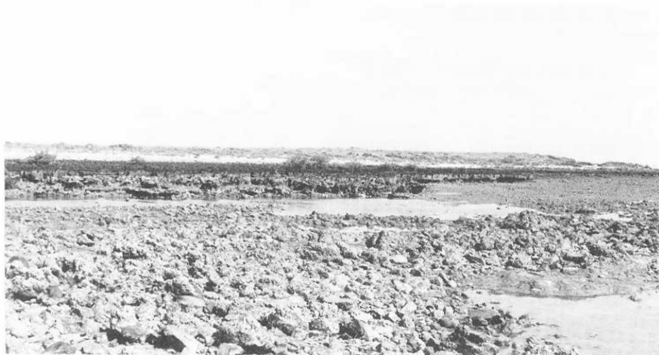
• Parts of the south-eastern sector (looking north).