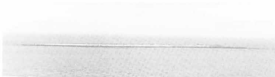
• The eastern side of Walcott Island, viewed from an elevated point on the adjacent mainland.