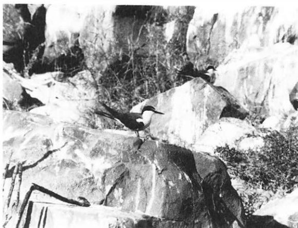
• Bridled Terns on their nesting territories on Haycock Island.