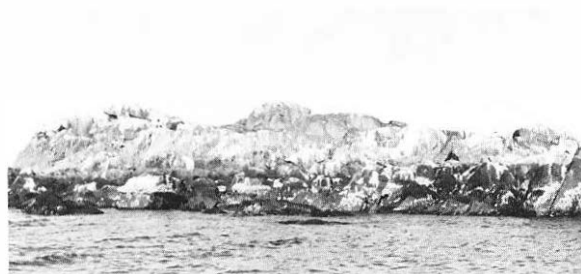
• Haycock Island (looking northward).