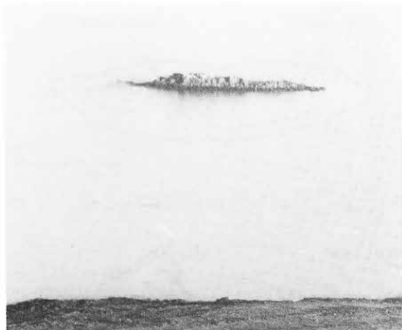
• Offshore view of Haycock Island (looking northward).