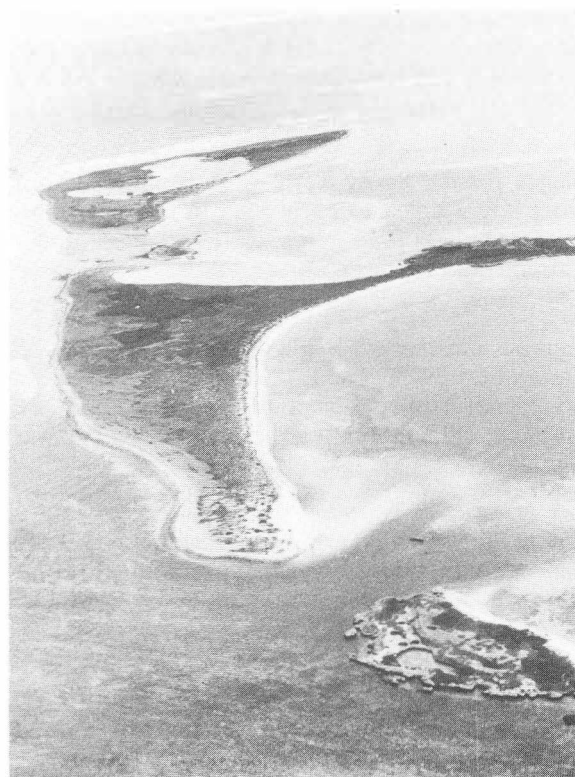
● Morley Island (looking south); Crake Island in the foreground and Wooded Island in the background.

Puffinus assimilis Little Shearwater — About 3 000 breeding pairs. Most burrows are in the sandy dune along the northern side and in sand and guano along the western side and around the southern end of the lagoon. Burrows range from 50 cm to 100 cm long and had a density of 1.2–1.4/m 2 in August 1977. On 15 August 1983, most burrows had been freshly re-excavated and were ready for eggs; 12 were examined and all were empty. On 22–28 August 1970, Green 1 heard calls from some burrows which were undoubtedly adults. On 23 August 1977, most burrows contained a single adult sitting on a well incubated egg. In October 1981, burrows contained downy young. On 6 November, 1991 burrows contained almost fledged young. On 10 December 1945, most burrows were empty and some dead birds (probably young) were found on the surface.