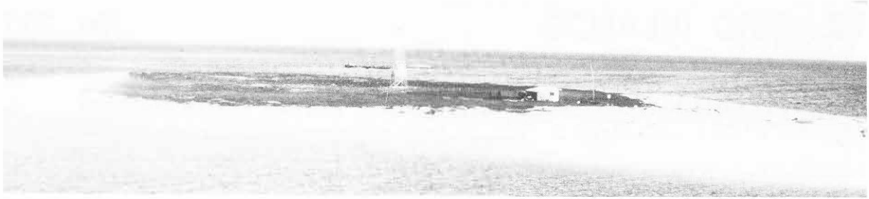
● Bramble Cay (looking south-east), November 1979.