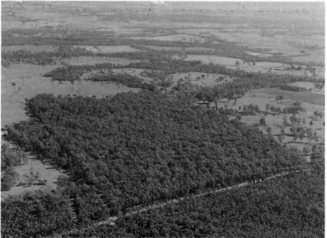
Figure 1. Aerial photograph of the study site, looking north-west and showing forested and unforested adjacent areas including riparian vegetation that connects the study area to the Nepean River. (Key illustration: Marion Westmacott.)