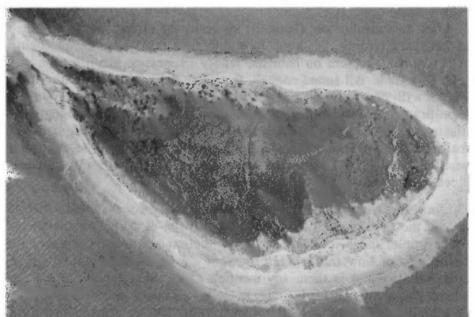
• Low Wooded Island from the air.