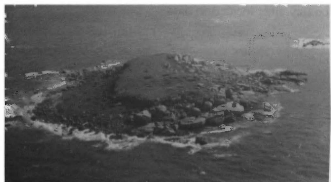
• Higginson Islet (looking east-north-east).