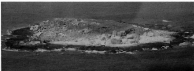
• Higginson Islet, (looking south-west).

Anous stolidus Common Noddy — Small numbers (100+ nests, with eggs) recorded in May 1994 and 1996 of the only two dry season checks. Eggs layed on bare rock around the side slopes of the island, mostly at the eastern and western ends. Numbers in excess of 500 recorded in September 1994 but no nesting occurring at that time. Extensive surveys of the Northern Territory coast by R. Chatto show this to be the only Common Noddy breeding in the 150+ seabird colony sites located to date.