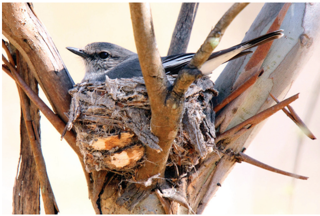
Figure 2. Female Hooded Robin incubating, on nest, Gara TSR (native eucalypt woodland), spring 2011. A pair reappeared at Gara in 2011 (see text), but also had five successive unsuccessful nests that year.