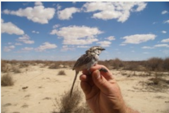
Grey Grasswren with transmitter attached