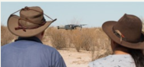
Our drone which we nicknamed "Darryl" after one of our original team who couldn't make it this time

We had to leave flying the drone until all tracking readings were completed so that we didn't disturb the birds but unfortunately windy weather curtailed our flying to early in the morning and sometimes late in the afternoon – not ideal times to take vegetation photographs as we really needed the least amount of shadows possible.