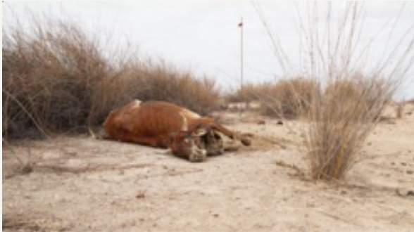
Not a pretty sight on the property

A 3-week trip was organised for the last week in August and the first 2 weeks in September to visit the area again. We were a little apprehensive as this trip coincided with one of the worst droughts on record for the western region of NSW but this was an ideal opportunity to map the birds' territories during these harsh conditions. What faced us when we entered the property was not pretty.