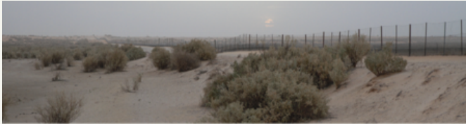
The NSW/Qld. border fence