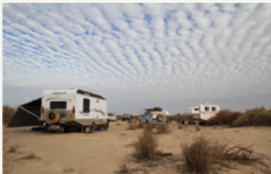
Our campsite at Barton's Crossing