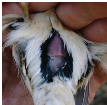
Brood Patch 5 (Graham Austin). Early stages of feathering over.