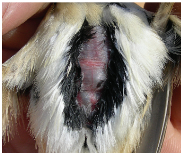
Brood Patch 1 (Chris Redfern). Not completely defeathered.