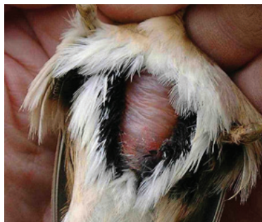
Brood Patch 3. Early stage, partially engorged.