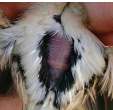
Brood Patch 4 (Graham Austin). Engorgement gone but still wrinkled.