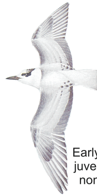
Early stage of moult from juvenile to first immature non-breeding plumage