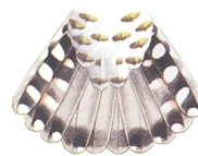
Adult Male Undertail