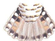
Adult Female Undertail

Ssp. C. l. plagosus (breeds Tas, eastern & s-w. Aust. then migrates to N. Aust, Indonesia and New Guinea in the non-breeding season)