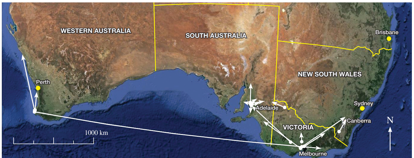
Figure 3: Band recoveries for the Little Eagle in Australia ( > 5 km, n = 22).