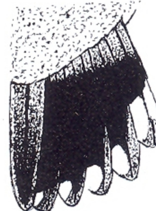
G.I. cantator (east coast s. from Cleveland Bay n-e Qld to Sydney region NSW)