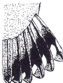
G.I. laevigaster (northern Aust from Kimberley to Cape York)

Variation in upper tail pattern between subspecies: