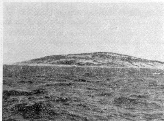
• Charley Island (looking south).

out the island where soil depth permitted burrowing. Most burrows were from one to two metres long but generally within 30 or 40 cm of the surface. Burrow concentration was greatest in the two areas of the southern slopes (1982 visit). Probably present to breed from late in September to the end of April or early in May when the young leave; egg laying occurs late in November to early December. Estimated 500-1000 breeding pairs.