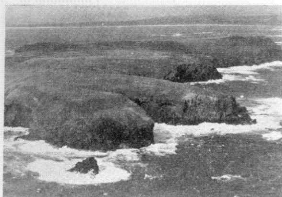
•Trefoil Island (looking south-east). Woolnorth Point on the mainland is in the background.