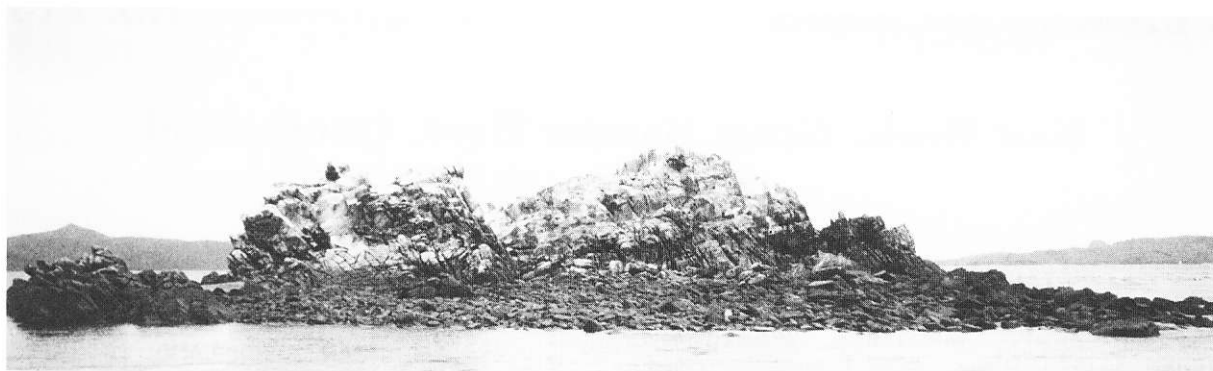
● East Rock (looking east).