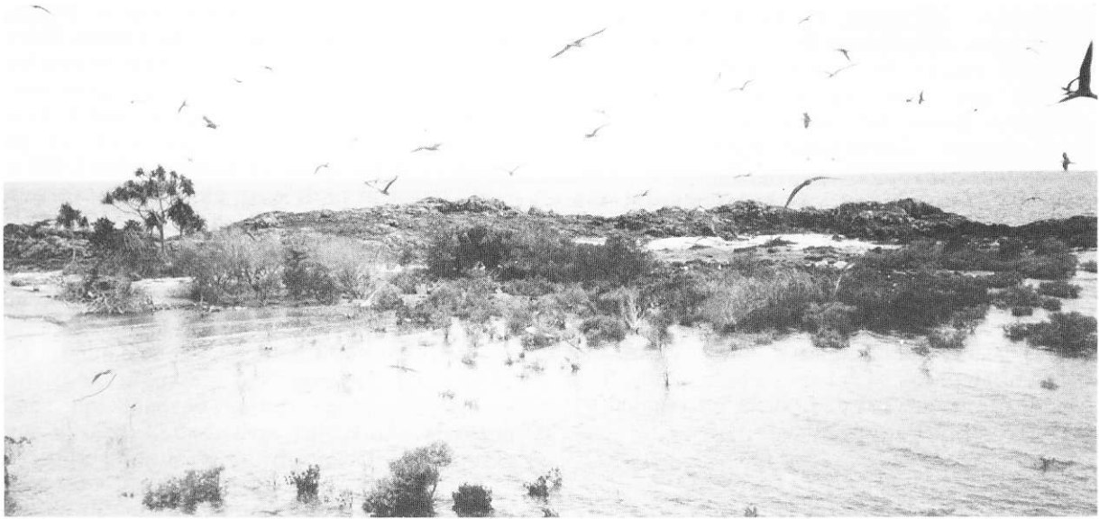
• Eastern nesting islet of Sisters Island.