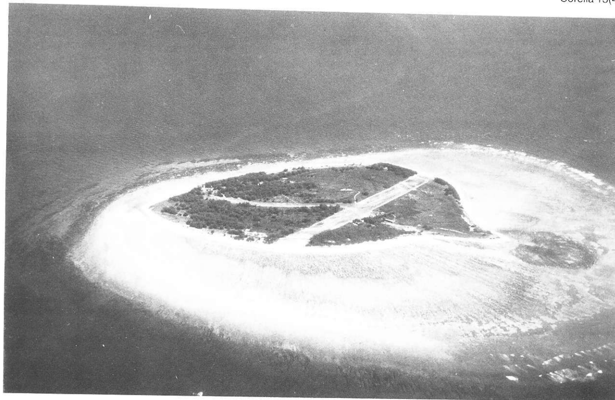
• Lady Elliot Island from the air (looking north-west).